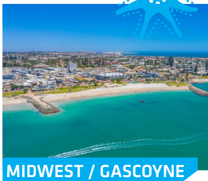
MIDWEST / GASCOYNE

Living close to our campuses in Geraldton, Carnarvon and Exmouth puts you only a stone's throw away from some of the best beaches, water sports and iconic natural landscapes in Australia. Paired with a fantastic events & arts scene, what isn't there to enjoy in these regions?